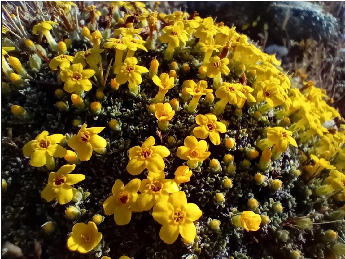
Figure 9. The riverbed forget-me-not ( Myosotis uniflora ; At Risk – Naturally Uncommon) in full flower.

The effects of climate change are not limited to those outlined above. Changes in pest animals (including insects, that are also a major threat to our agricultural industry), will likely follow. An example of potential pest impacts on plants is the expansion of rodents into higher altitude areas where they feed on the seeds of native species. The loss of seeds from rodent predation can lead to a process called recruitment failure, whereby populations of plants are unable to produce viable offspring. In fact, the many impacts of climate change will likely interact in complex ways to create a cascade of pressures on plants (as well as our ecosystems and agricultural systems) than we can comprehend from our current viewpoint. Although, what we are observing now should be enough to scare us into climate action.