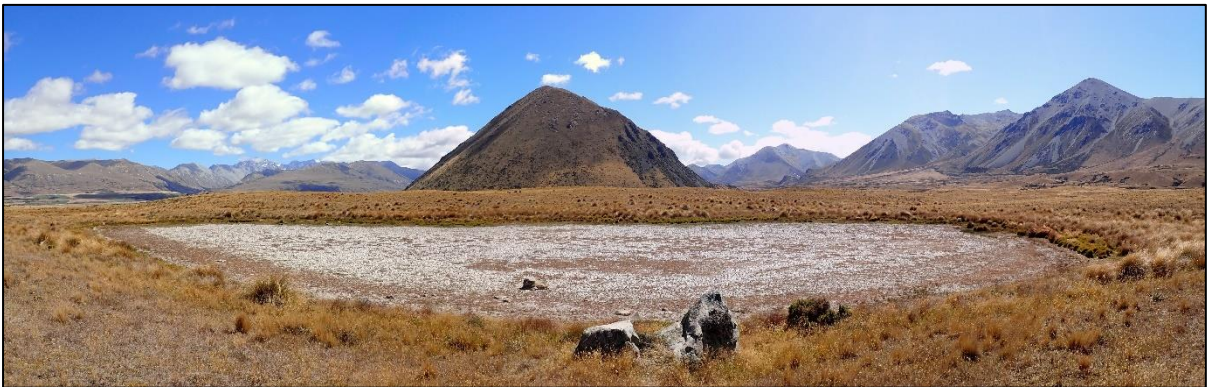
Figure 3. An example of an ephemeral wetland in its dry state, a naturally rare ecosystem with the threat status of Critically Endangered.