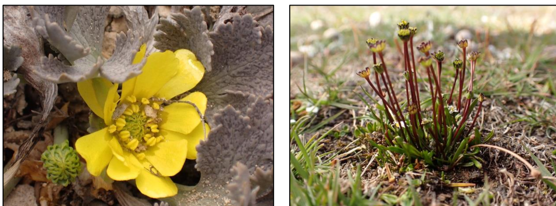
Figure 6. Examples of DOC’s “species on the brink” plants. The Castle Hill buttercup ( Ranunculus paucifolius ) on the left and a minute daisy Brachyscome linearis on the right.

Of the “on the brink” plants, 90% are found nowhere else in the world. Extinction of these species means they are gone globally, and we lose a component of what makes Aotearoa New Zealand unique. Therefore, these are species that require enhanced protection, not a substantial erosion of what protections they currently have, as this Bill will cause.