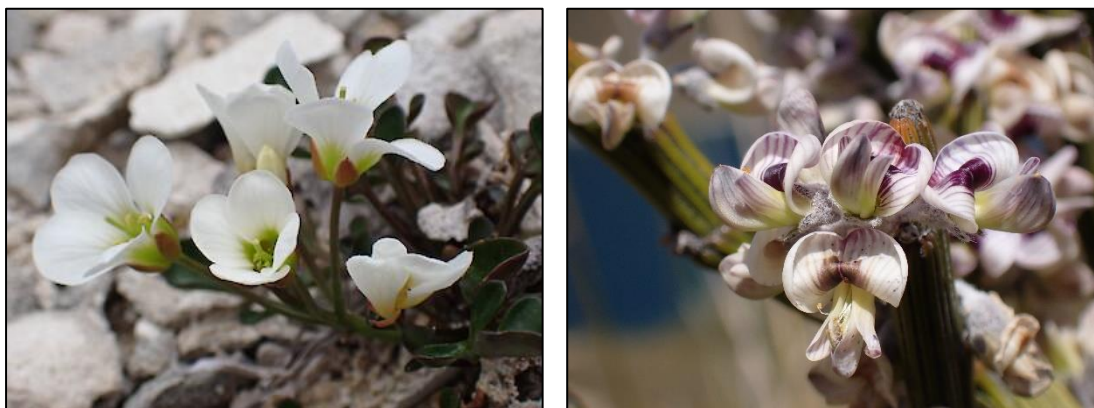
Figure 5. The Threatened – Nationally Critical limestone cress ( Cardamine magnifica ) on the left and the At Risk – Declining coral broom ( Carmichaelia crassicaulis subsp. crassicaulis ) on the right.

Examples of more obscure, but no less important, Threatened and At Risk plant species include a Nationally Critical limestone cress ( Cardamine magnifica ) and a coral broom ( Carmichaelia crassicaulis subsp. crassicaulis ) (Figure 5).