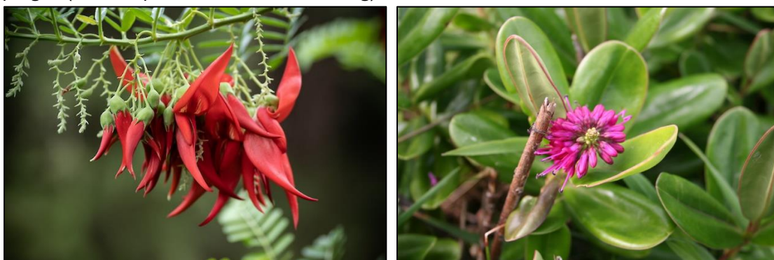
Figure 4. The Threatened – Nationally Critical kākābeak ( Clianthus maximus ) on the left and the At Risk – Declining purple hebe ( Veronica speciosa ) on the right.

Examples of more obscure, but no less important, Threatened and At Risk plant species include a Nationally Critical limestone cress ( Cardamine magnifica ) and a coral broom ( Carmichaelia crassicaulis subsp. crassicaulis ) (Figure 5).