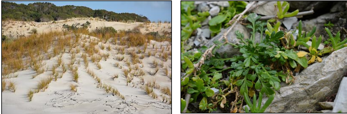
Figure 8. Examples of coastal plants that will suffer as sea levels rise. Pīngao ( Ficinia spiralis ; At Risk - Declining), photo by John Sawyer CC-BY-NC (left); and a species of Cook's scurvy ( Lepidium flexicaule ; Threatened – Nationally Endangered), photo by Jane Gosden CC-BY-NC-SA (right).

Plants of coastal ecosystems (Figure 8), many of which are already squeezed between human developments and the advancing sea, will likewise have nowhere to go as sea levels rise. Examples of threatened coastal plants facing an uncertain future are the Cook's scurvy grasses ( Lepidium species), the taonga species pīngao/pikau ( Ficinia spiralis , At Risk - Declining) and a native hibiscus ( Hibiscus diversifolius subsp. diversifolius , Threatened – Nationally Critical).