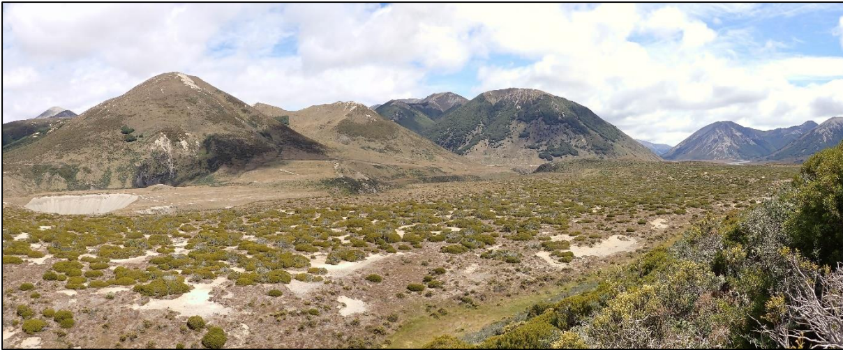
Figure 2. An example of a strongly leached terrace ecosystem (sometimes referred to as (Wilderness vegetation'), a naturally rare ecosystem with the threat status of Critically Endangered.