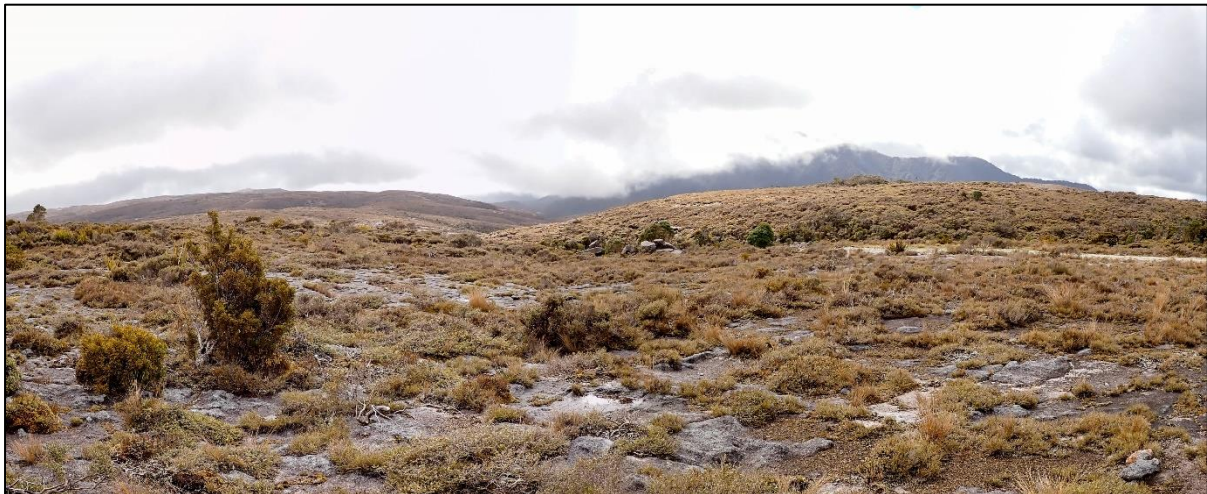
Figure 1. An example of a sandstone erosion pavement, a naturally rare ecosystem that has a threat status of Endangered.