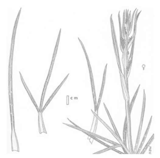
Reproduced with permission from Stewart Island plants (1982).