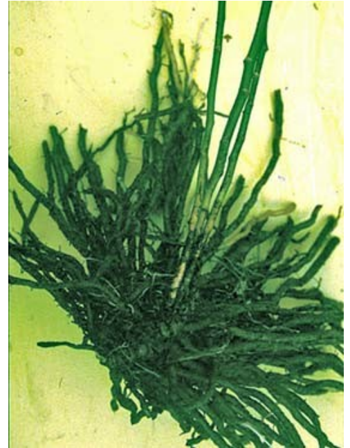
Tubers of 3.8m-tall vine, Wanganui. Photographer: Colin C. Ogle, Licence: CC BY-NC.