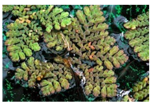
Lake Wiritoa. Jan 2009. Photographer: Colin C. Ogle, Licence: CC BY-NC.