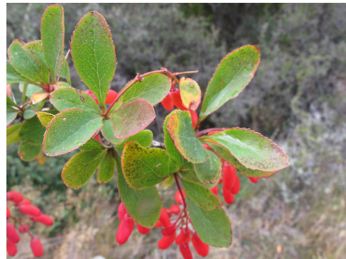
Ahuriri Valley, Canterbury.