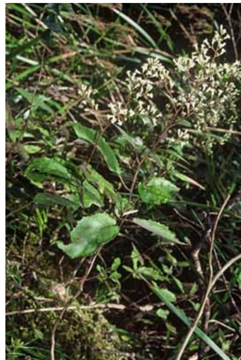
Upper Kaueranga Range.