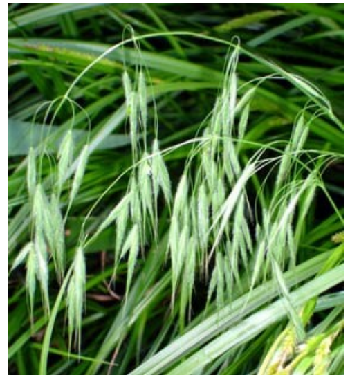
Bromus arenarius inflorescence after anthesis, ex. cult.