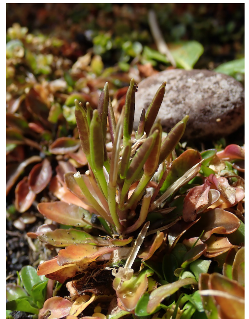
Enderby Island, Auckland Island Group. Photographer: Alex Fergus, Date taken: 16/12/2017, Licence: CC BY-NC.