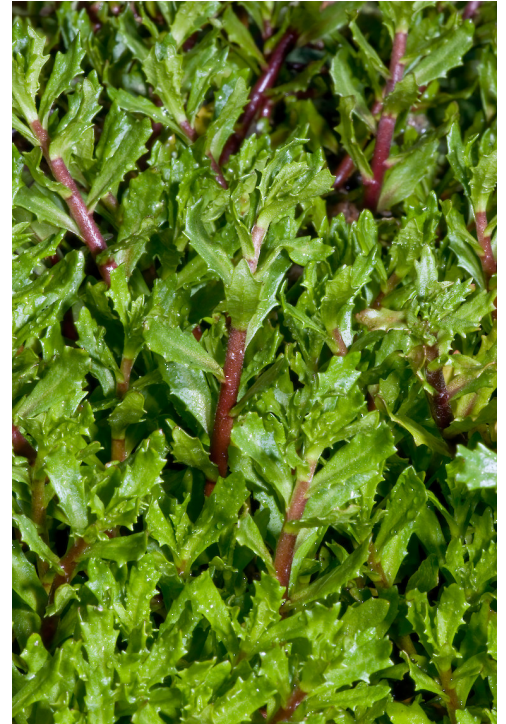
In cultivation ex Waitakere.