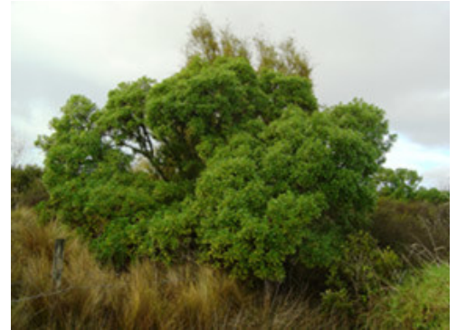
Ngaio. Photographer: Wayne Bennett, Licence: CC BY-NC.