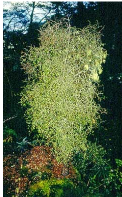
Mt Ruapehu, September.