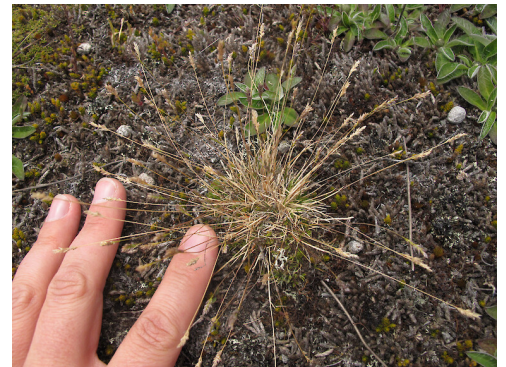
Photographer: Melissa Hutchison, Date taken: 30/11/2016, Licence: CC BY-NC.