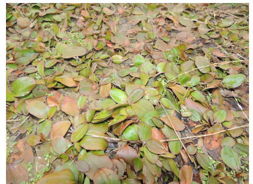
Central Southland. Photographer: Jesse Bythell, Date taken: 26/02/2016, Licence: CC BY-NC.