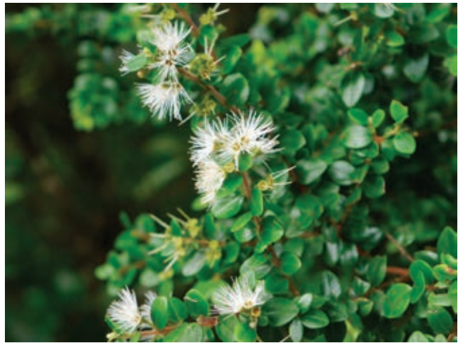
Metrosideros perforata in flower at Otari Wilton's Bush.

Myrtaceae species that are already in the seedbank include: Bartlett's rātā / rātā moehau ( Metrosideros bartlettii ) from Northland, pohutukawa ( Metrosideros excelsa ) from Auckland, northern rātā ( Metrosideros robusta ) from Northland; white rātā ( Metrosideros perforata ) from Mānawatu; white rātā ( Metrosideros diffusa ) from Mānawatu; kānuka ( Kunzea robusta ) from Taranaki; mānuka ( Leptospermum scoparium var. scoparium ) from Taranaki and Dunedin; Neomyrtus pedunculata from Central Plateau and Taihape, and Lophomyrtus obcordata from Auckland and Taihape. Earlier this month, At Risk—Declining kānuka / rawiritōa ( Kunzea amathicola ) seed were collected from Porirua.