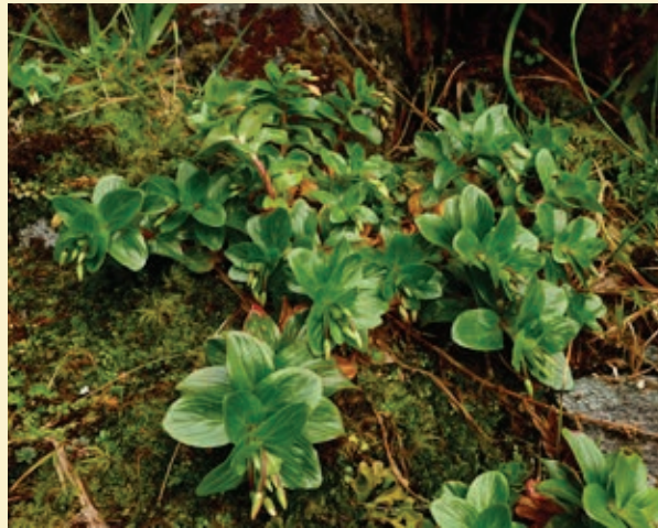
Epilobium matthewsii .

The plant of the month for March is Epilobium matthewsii or Fiordland willowherb, one of many Epilobium species native to New Zealand. As the common name suggests, the stronghold for E. matthewsii is in the depths of Fiordland where it can be found mostly in alpine and sub-alpine habitats. It is also apparently found on the Tin Range on Stewart Island. The species lives on shaded, damp rocky faces, avalanche schutes, fresh rock fall piles and in the splash zone of streams. It is often sympatric with the other Epilobium species, such as E. glabellum , E. brunescens and E. gracilipes .