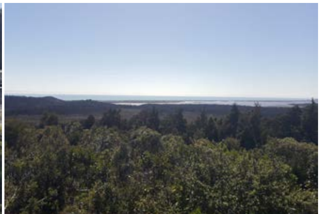
The magnificent view of Okarito Lagoon from the top of the Okarito Pakihi track.