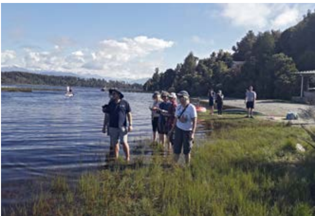
Delegates visit Lake Mahinapua where we encountered several kotuku up close.