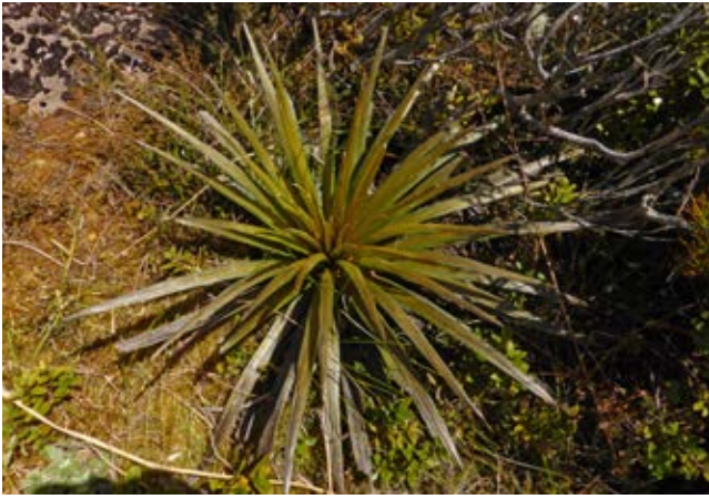
Figure 3: Celmisia armstrongii .