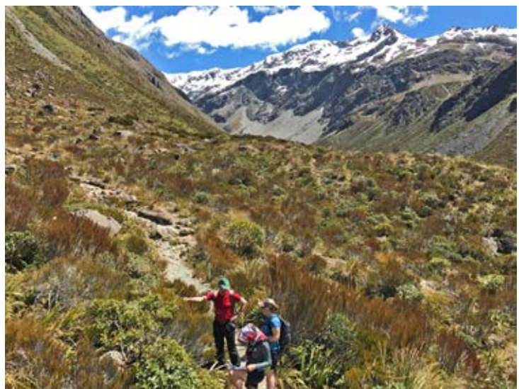
Figure 1: Looking up the valley over Dracophyllum shrubland.

We were very fortunate to have such knowledgeable and patient leaders who dangled the ‘botanising is even better’ carrot to get us heading in the right direction up to the footbridge at the Otira River. A short distance up the track, in boulder field, we were rewarded by Ranunculus lyallii flowering profusely, simply stunning (Fig. 2). Shrubs included Olearia cymbifolia with its remarkable saddle shaped leaves, the chunky Melicytus alpinus and the hebes (or veronicas depending on what you want to call them) Hebe canterburiensis and H. subalpina .