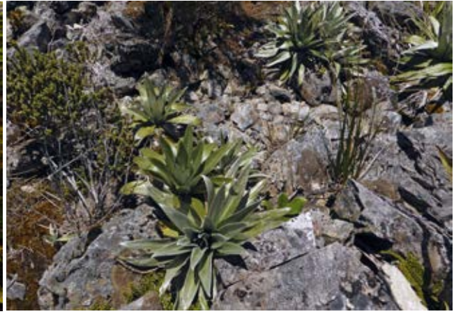
Figure 4: Celmisia semicordata ssp. semicordata .

Where the track meets the Otira River at around 1000 m the vegetation is dominated by herbaceous species with occasional shrubs (Fig. 5). In this area, my favourites were the sweetly scented cushion plant Raoulia tenuicaulis in full bloom, Parahebe lyalii and the tiny flowering Leonohebe cilliata (Fig. 6).