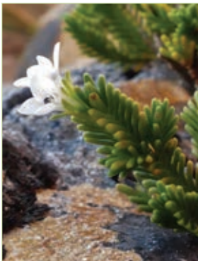
Veronica hookeri .