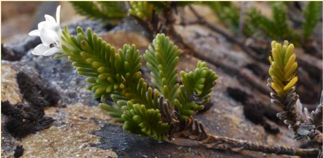
Veronica hookeri .

The plant of the month for December is Veronica hookeri , one of five of the 'semi-whipcord' group of Veronica species, all endemic to New Zealand. The species is adapted to exposed habitats in the mid to high alpine zone. It is generally found in boulder-fields and on rock outcrops, especially along exposed ridge crests where the plants are often found growing out of cracks in large rocks. The species can be found in the wetter western areas of the South Island, from Kahurangi National Park to Ben Ohau Range behind the Mackenzie Basin. The plants form small woody sub-shrubs with tiny, hairy-edged leaves packed close to the stems. When looking from above, the leaf arrangement on the stems is cruciform (in the shape of a cross). Small clusters of white flowers are borne near the tips of the shoots, mainly between November and February.