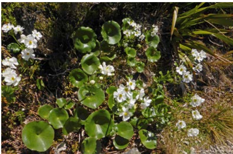
Figure 2: Ranunculus lyallii .

A high diversity of herbs, around 129 species, occurs in the valley. I have highlighted a few that struck me as rather beautiful. Of the many Celmisia spp. three caught my eye, the yellow veined Celmisia armstrongii , (Fig. 3), the strikingly silver and bold C. semicordata ssp. semicordata (Fig. 4) and the ubiquitous C. discolor . Anaphaloides bellidoides has to be the most fun name to say and it was in early flower. Drosera arcturi was seen where expected on a bryophyte encrusted seep.