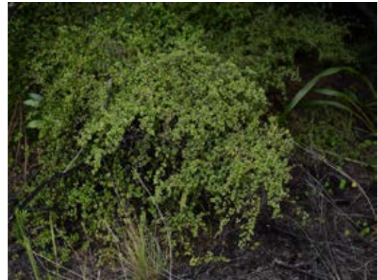
Fig. 8. One of the myriad forms of Coprosma aff. neglecta ; a common understorey element in both forest and shrubland.

As is the case with many coastal shrublands, the bulk of this plant community consists of hummocks of compact manuka and kanuka, beneath which large numbers of Coprosma aff. neglecta (Fig. 8) form weeping mounds. Needless to say, after 6.5 hours of walking, the option of slowing down to absorb some of the plants within this area was a welcome stop. Having laboured the point about the length of the walk in (which more than justifies the effort), it is only left to say that the first day's exertions were not repeated on the return leg—wherein common sense had already prevailed, and we took the far less taxing route of a short(ish) walk back to Deep Water Cove, a leap into the ocean, and the comfort of a water taxi.