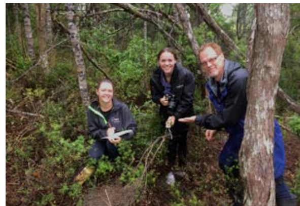
Fig. 1. Unitec students and staff undertaking field studies of mushroom diversity in a regenerating kauri ( Agathis australis) / tanekaha ( Phyllocladus trichomanoides) forest at Mataia, a QE II Covenant near Glorit, Kaipara.

The Environment and Animal Sciences Pathway at Auckland's Mt Albert Unitec Institute of Technology campus offers a Bachelor of Applied Science. For that degree, students undertaking environmental studies are taught a range of field skills, ecology and notably taxonomy (Fig. 1). To aid with teaching field ecology and taxonomy, in 2001 the faculty started what was initially intended to be a 'small' teaching herbarium. However, student and staff research interests have seen that herbarium grow rapidly. In 2012, the herbarium was registered with Index Herbariorum with the code 'UNITEC'. In April, UNITEC accessioned its 10,000 specimen, notably a lichen, Usnea inermis . As UNITEC is a relatively 'new' herbarium in New Zealand we thought it would be useful to document its history, holdings and activities.