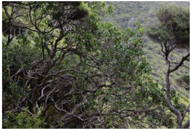
Fig. 2. One of the myriad forms of Coprosma aff. neglecta ; a common understorey element in both forest and shrubland.

of keeping moving was later vindicated as we approached and walked over Cape Brett itself (during daylight, I should add), where narrow sections of track fall suddenly away towards precipitous cliffs. The thought of negotiating these in the dark, which I am certain happens on a semi-regular basis (given the possibility of under-estimating this walk), does not fill me with great enthusiasm.