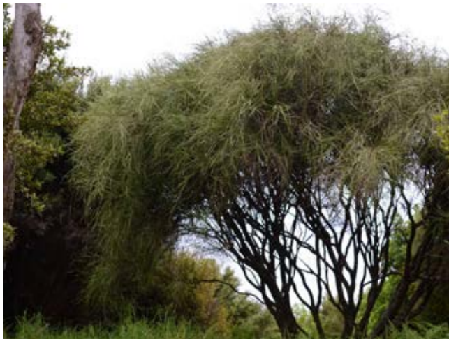
Fig. 3. Monstrous brooms occupy high points of the peninsula.

I managed to avoid sighting Colensoa physaloides (one of the species that was noted in NZPCN records), whether that was because of its absence or my haste in the middle sections of the track (based on our desire not to arrive at the hut after nightfall) is unknown. My apprehension regarding the benefits