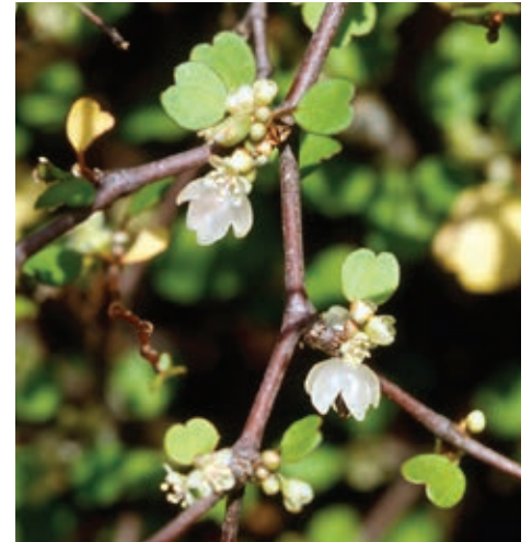
Muehlenbeckia astonii.