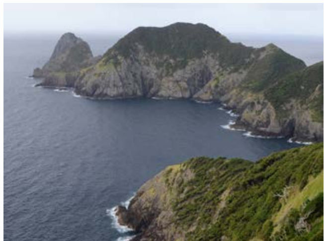
Fig. 1. Looking along the spine of Cape Brett's Peninsula.

Despite having planted coastal maire ( Nestegis apetala ) in a wide array of projects and situations (from coastal peninsulas to the foot of high-rise buildings in Central Auckland), before this trip, I had never seen this attractive (and extremely useful) species in the wild. It was therefore gratifying to see so many plants of N. apetala