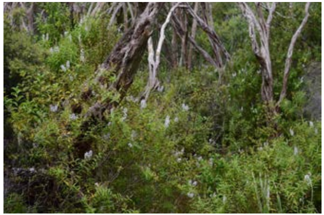
Fig. 4. The pale foliage and pale lilac flowers of the shade-tolerant Veronica ligustrifolia inhabit the understorey of kanuka woodland.

As we moved into the outer (eastward) parts of the peninsula, we shifted from very much walking within the forest canopy to registering it from outside. Here, patches of diverse northern coastal forest (Fig. 5) sit amidst large tracts of the dominant mantle of kanuka, in which the vibrant green tones of coastal maire ( Nestegis apetala ), tawaroa (the northern coastal form of Beilschmiedia tawa ) and puriri endure, in addition to good signs of regeneration. Having been itching to see coastal maire in the wild for a long time, there was no shortage of specimens to take in, both adjacent to the track and within the distant canopy. Meanwhile, on the lower slopes descending towards the seashore, whau makes an occasional appearance, whilst the northern kowhai, Sophora chathamica punctuates the kanuka.