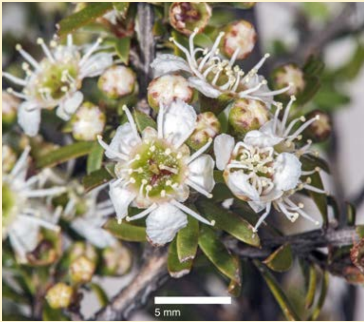
Kunzea tenuicaulis .

The plant of the month for May is Kunzea tenuicaulis or 'geothermal kanuka', one of 10 Kunzea species endemic to New Zealand. As the common name suggests, the stronghold for K. tenuicaulis is the geothermal area of the central North Island, where it can be found in active geothermal fields from Kawarau to southern Lake Taupo. The species generally lives in warm geothermal soil within the gas zone of active vents, where it forms thick shrubland or low forest, with the trunks often being covered in brightly coloured lichens. When close to vents, it forms low shrubby clumps, but increases in size slightly