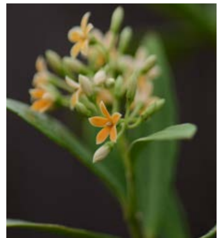
Fig. 6. An orange-flowered form of native jasmine growing through small trees and shrubs near Cape Brett itself.

Quite apart from the prevalence of intense pink forms of Parsonsia capsularis in the southern parts of the country (which I have seen in several places within Canterbury), I had read about red and orange variants of P. capsularis var. grandiflora —including Carse’s description of the colour occurring in a shade that is “red like the flesh of a pumpkin”. I’m not quite sure what this says about the state of our present-day pumpkins, as I’ve never seen one I’d call red. That, notwithstanding, this particular variation, which I would describe as an apricot hue, was an extremely interesting find; one which was manifested in several individuals that I viewed.