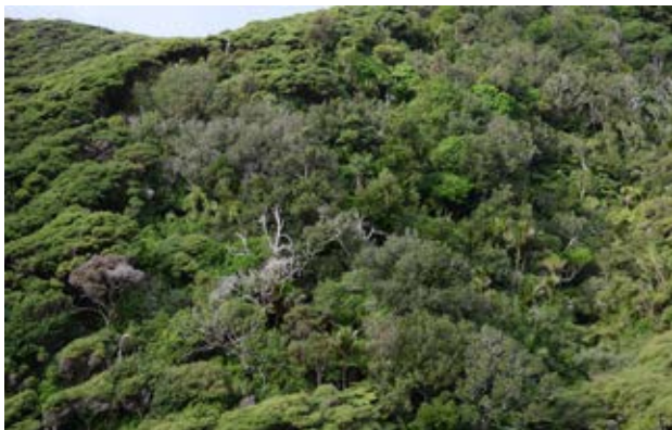
Fig. 5. The deep green mosaic of northern coastal forest, with a composition that is now rare on the mainland.

By the time we reached the final stages of the track, I was pleased to have a clearer idea of our distance to the hut, which afforded the opportunity to observe some of the plants amidst the wind-blasted shrubland with a little more time up my sleeve. The most surprising of these was an orange-flowered form of Parsonsia capsularis var. grandiflora (Fig. 6) that winds its way through the vegetation on the southern side of Cape Brett itself.