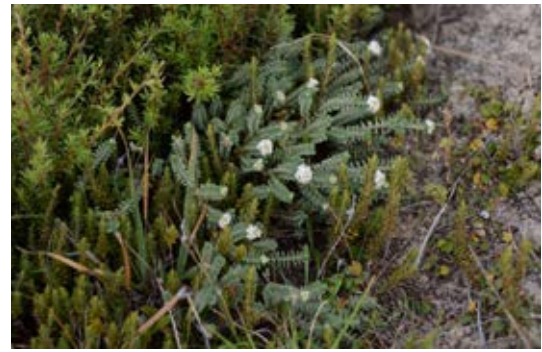
Fig. 7. Pimelea urvilleana in wind-blasted ground, growing with Leucopogon fraseri .

In the wind-scoured bare ground that one passes through before climbing over the final hill to the Cape Brett lighthouse and hut, Pimelea urvilleana (Fig 7) grows amongst Leucopogon fraseri . Given the proliferation of species within recent years, a definitive statement on the identity of certain Pimelea spp. sometimes makes me break in a cold sweat, but its stature, stout stems and general cut of its jib fit with my experience of having planted a great deal of P. urvilleana in gardens and public plantings.