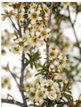
Kunzea tenuicaulis .