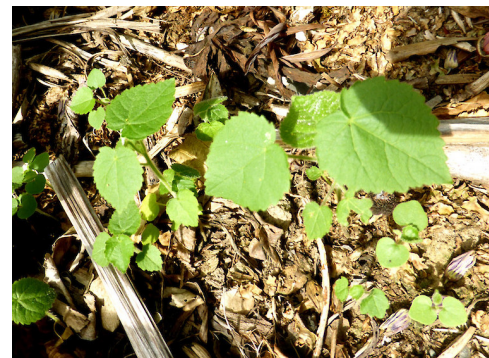
Seedlings in site where adult shrub had been removed ; garden near Fordell, Whanganui.