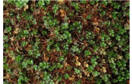
Fruiting in Research gardens, Botany Department.