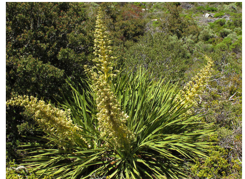
Dingleburn.