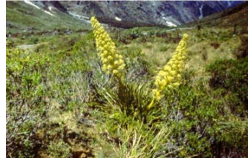
Hollyford Valley, December.