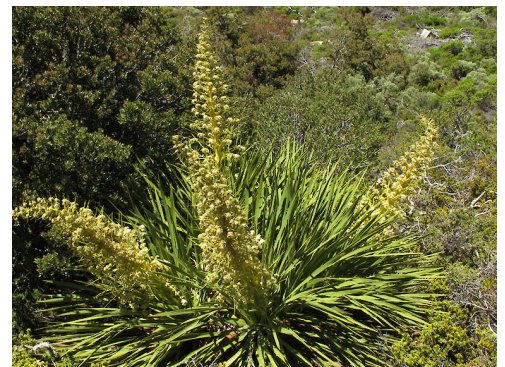
Dingleburn.