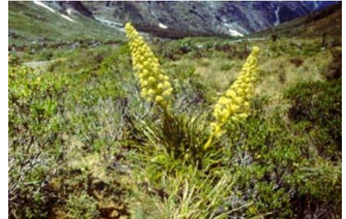
Hollyford Valley, December.