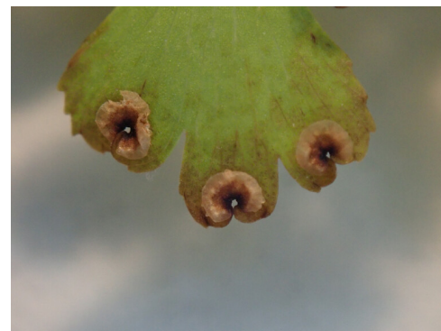
Photographer: Melissa Hutchison, Date taken: 02/10/2019, Licence: CC BY-NC.