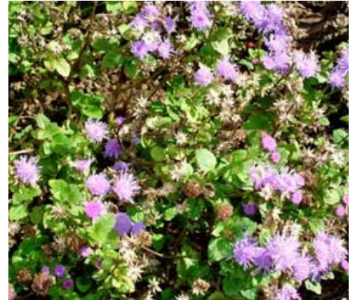
Ageratum houstonianum in flower (wild plant), Dover Road, St Andrews, Hamilton. Photographer: Peter J de Lange, Date taken: 07/05/2006, Licence: CC BY-NC.