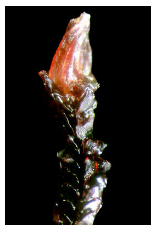
Allisoniella scottii.