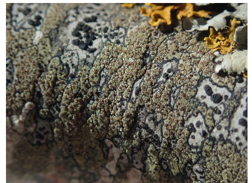
Corticolous on urban plane tree, Grey Lynn Auckland. Photographer: Marley Ford, Date taken: 02/09/2021, Licence: CC BY.