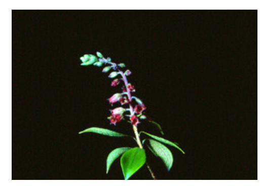
Mt Kaitarakihi, December.