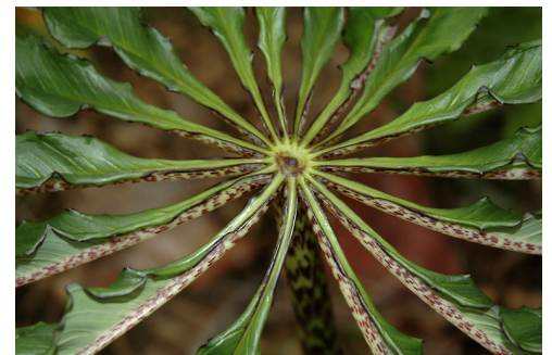
'centre' of leaf stalk; garden, Fordell, Whanganui.