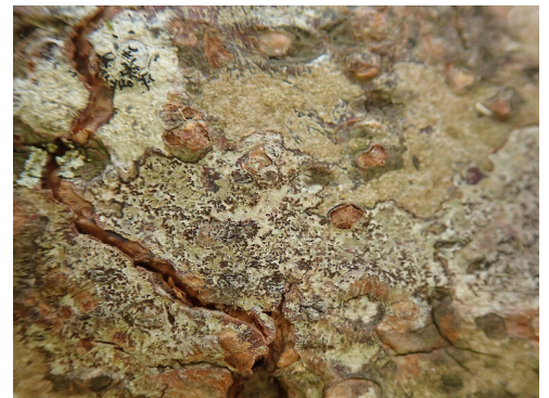
On common alder, next to Waikatō River at Rangiriri. Photographer: Melissa Hutchison, Date taken: 25/02/2022, Licence: CC BY-NC.