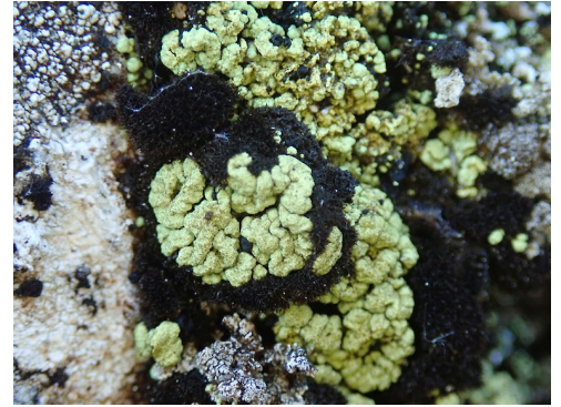
Lake Ida, Canterbury. Photographer: Melissa Hutchison, Date taken: 26/07/2020, Licence: CC BY-NC.