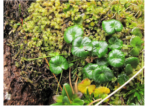
Auckland Island, above Port Ross.

Photographer: Geoffrey M. Rogers, Licence: CC BY-SA.