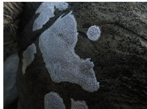
On coastal concretions, Hokianga Far North. Date taken: 01/11/2019, Licence: CC BY.