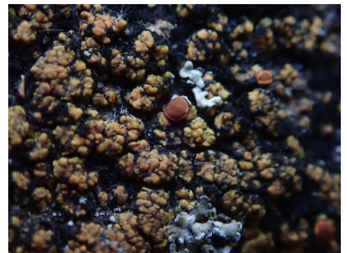
On basalt. Photographer: Marley Ford, Licence: CC BY-NC.