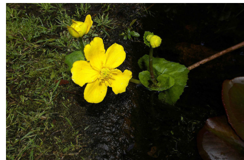
Caltha palustris, in cultivation.