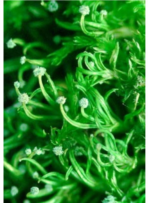
Calymperes tenerum.