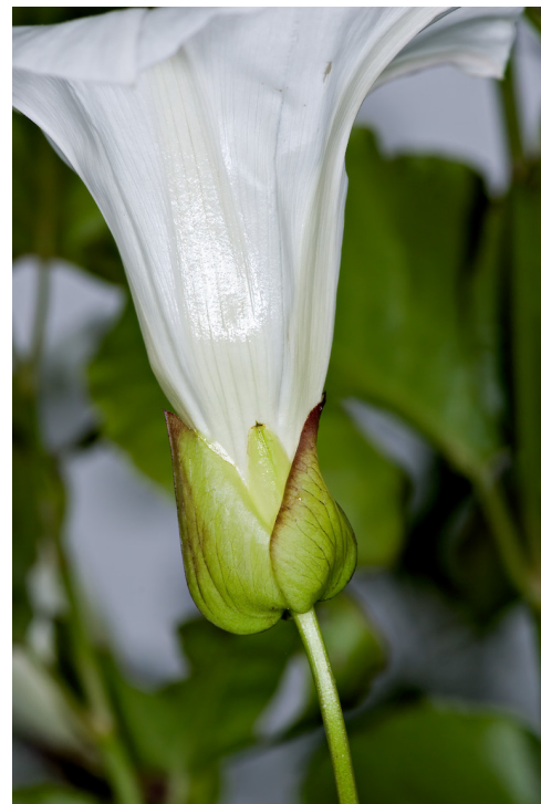
Involucral bracts overlapping. Hutt Valley.