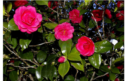
Camellia japonica, in cultivation. Photographer: John Smith-Dodsworth, Licence: CC BY-NC.