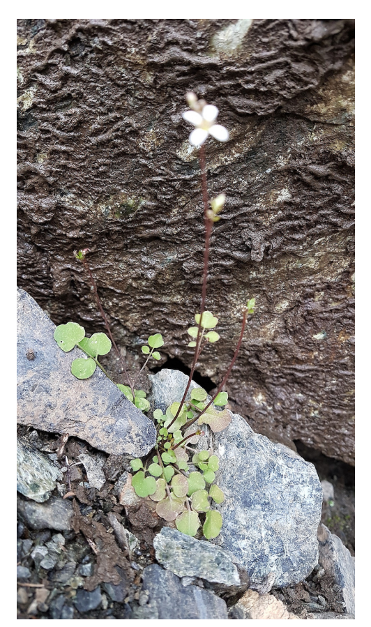
Richmond Range, Mt Richmond Forest Park. Photographer: Chris Ecroyd, Date taken: 22/11/2019, Licence: CC BY-NC.