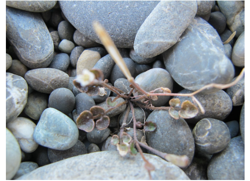
Kaitorete Spit, Canterbury. Date taken: 11/10/2014, Licence: All rights reserved.