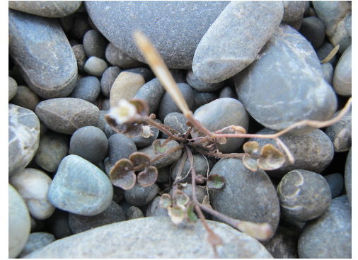
Kaitorete Spit, Canterbury. Date taken: 11/10/2014, Licence: All rights reserved.