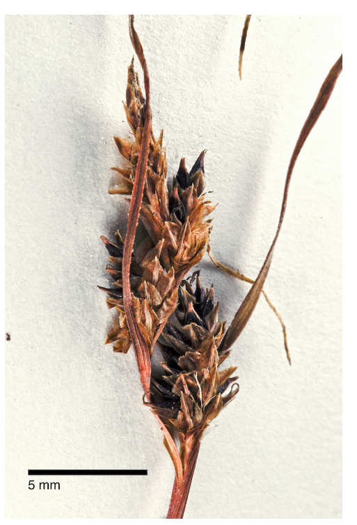
Herbarium specimen: AK 105020. Photographed with permission of Auckland Institute and Museum. Photographer: Jeremy R.

Herbarium specimen: AK 105020. Photographed with permission of Auckland Institute and Museum. Photographer: Jeremy R. Rolfe, Date taken: 23/10/2007, Licence: CC BY.