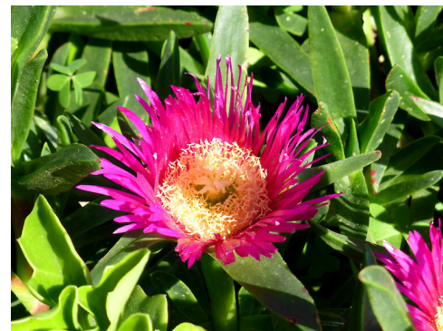
Waste area, Castlecliff Beach, Whanganui. Photographer: Colin C. Ogle, Date taken: 11/09/2016, Licence: CC BY-NC.