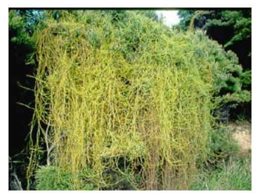
Waitiki, December.