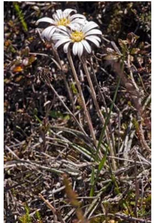
Desert Road. Nov 2008.