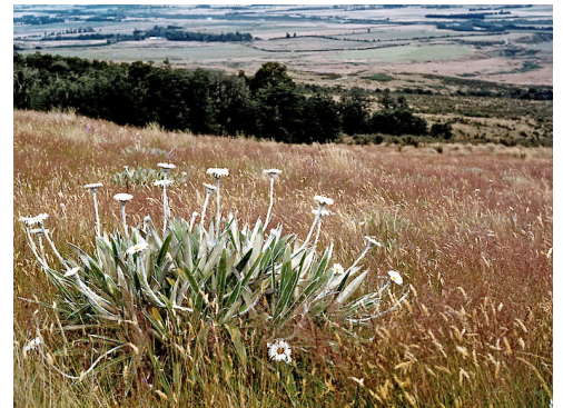
Mount Somers. Feb 1982.