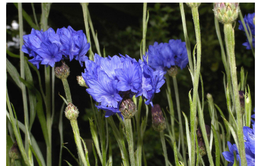
In cultivation.