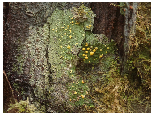
Stewart Island.