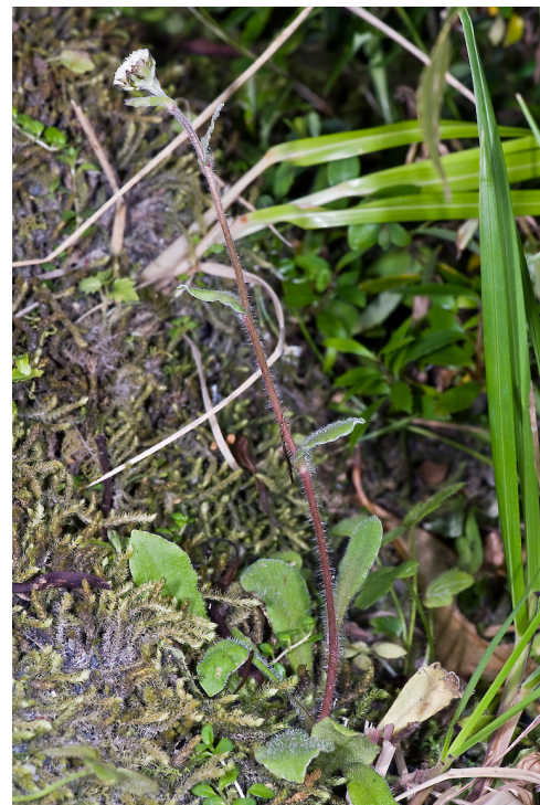
Waiohine Gorge, Tararua Forest Park. Date taken: 08/12/2007, Licence: CC BY.