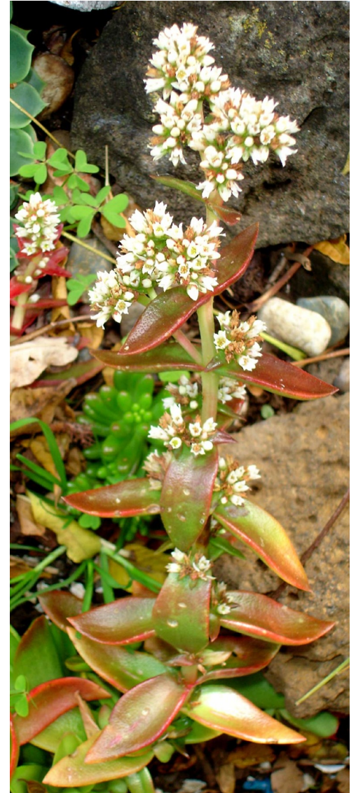
Crassula dejecta.