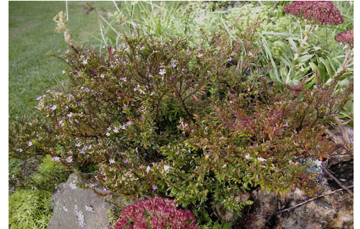
In cultivation. Photographer: John Smith-Dodsworth, Licence: CC BY-NC.