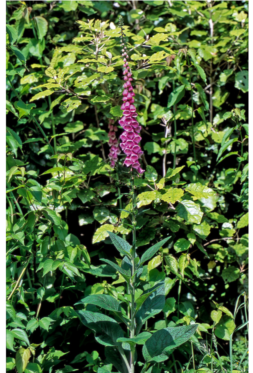
Stokes Valley, Lower Hutt.