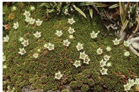
Donatia novae-zelandiae. Photographer: Department of Conservation, Licence: Public domain.