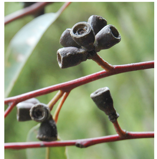
Capsules. Wanganui. Oct 2007. Photographer:

Photographer: Colin C. Ogle, Licence: CC BY-NC.