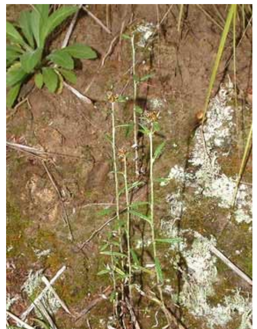
Piha, April.